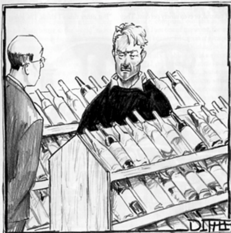
"What wine goes best with vodka?"