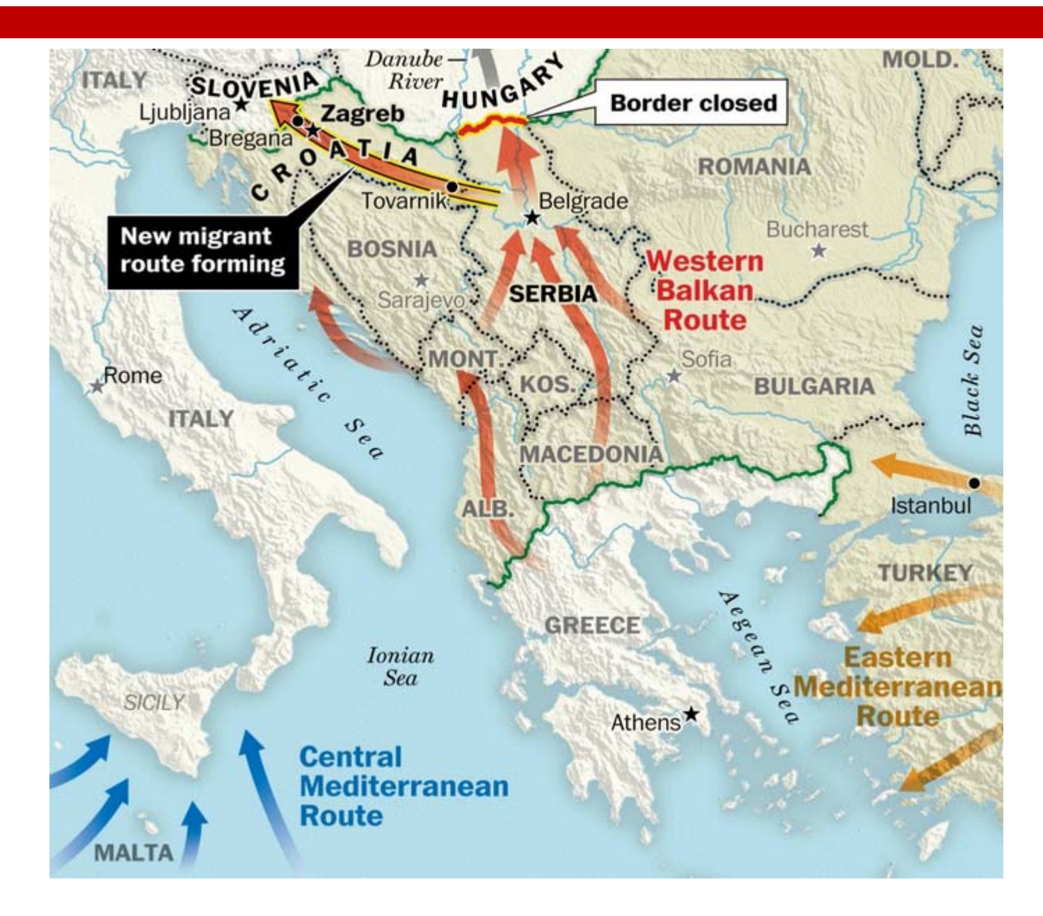
September 17, 2015: Over 11 000 migrants crossed Croatian border in one day!